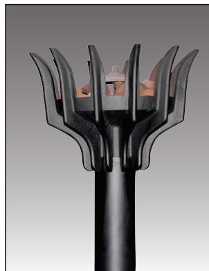
THE LIBERTY LT-N/LT-P