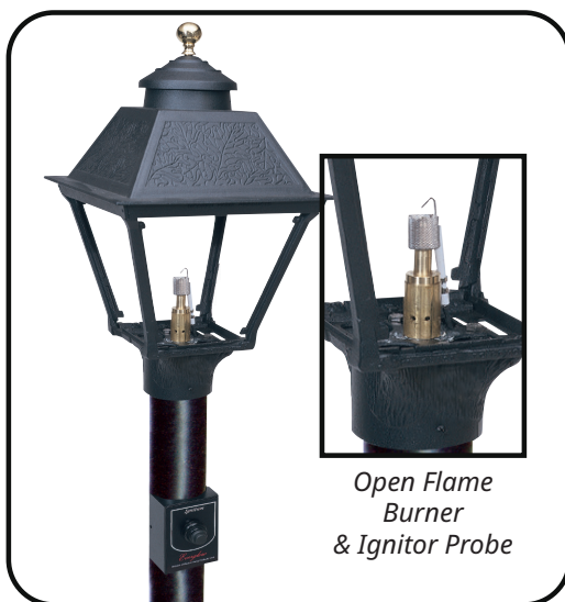
Open Flame Burner & Ignitor Probe