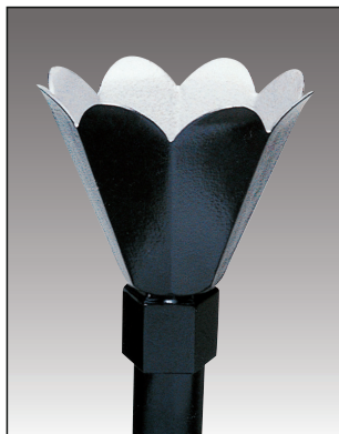
THE FLOWER FT2-N/FT2-P