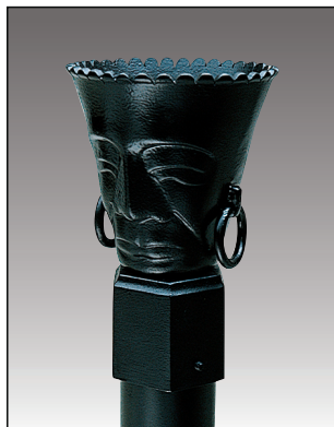
THE POLYNESIAN PT2-N/PT2-P

Shown mounted on an aluminum post (#POBAI)