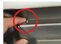
Depress the pin to install the door into the frame

Step 7. The Left and Right Doors can be easily installed by setting the door into the frame and inserting the lower door pin on each door into the corresponding hole located in the lower cart base. Once inserted into the lower cart frame hole, depress the top door pin with your finger and tilt the door back toward the door frame sliding the upper pin into the hole located on the top door support beam. The door is secure when you hear the top pin pop into place.